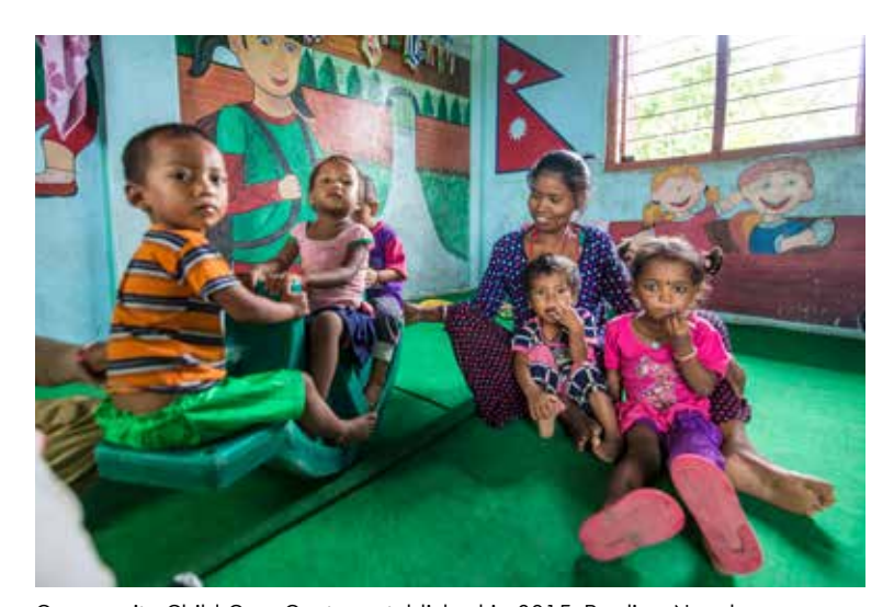
Community Child Care Center established in 2015, Bardiya, Nepal.

The worldwide average for access to very early childcare (from zero to three years old) stands at just 18%<sup>14</sup>, mostly provided by unregulated private actors, with